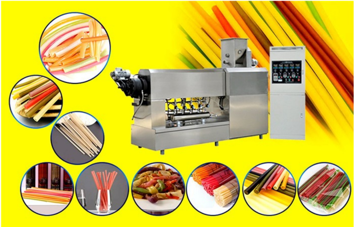
5. Sample display