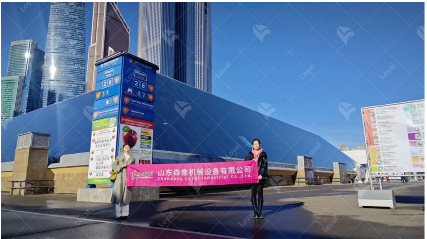
Photo 1 Group photo of Loyal staff at the exhibition

Celebrating Shandong Loyal Industrial Co., Ltd's participation in the 2023 Russia Food Processing and Packing Equipment Exhibition ? This is an excellent opportunity to showcase the company's technology and products, communicate with industry players in Russia and abroad, and find new business opportunities.