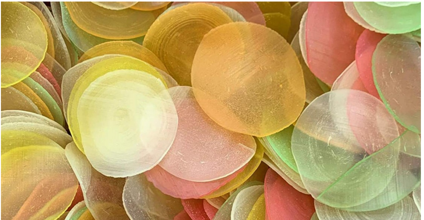
Sample of Colorful Shrimp Chips Pudding

He owns a puffed food production factory and produces puffed shrimp chips. He now needs drying equipment to dry puffed shrimp chips because he heard that this will make the product better. So I recommended our 100kg/h Microwave Colorful Shrimp Chips Pudding Machine to Tayeb, because puffed shrimp chips have colorful colors, we need to ensure their color and taste when drying them, microwave drying equipment will be the best choice.