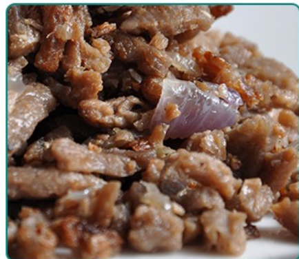
??Advantage of the soybean protein production line

Soybean protein has two main characteristics: