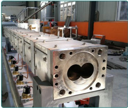
??Sample of the soybean protein production line