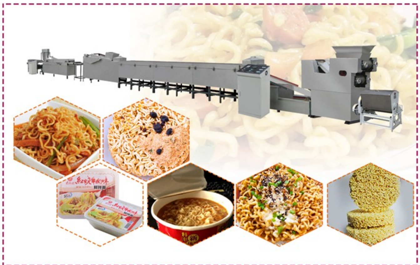
Commercial instant noodles making processing line

Automatic instant noodle production line was consisted of dough maker, forming host, steam noodle machine, cutting machine, frying machine and cooler. It is on the basis of the research of similar products at home and abroad, combined with the needs of the mass consumer market in China. With miniaturization the production features a new generation of products developed and manufactured by its technology to improve, compact design novel, stable and reliable performance. The automatic instant noodles production line from flour to finished product once complete, the high degree of automation, simple operation, moderate, production, energy saving, small footprint, the investment is only one tenth of the large-scale equipment, with less investment and quick. Special suitable for small and medium-sized enterprises.